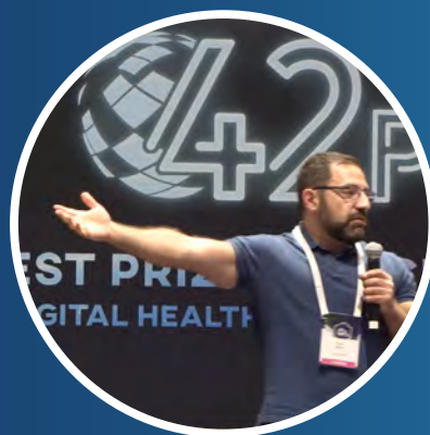
42PLUS1 PITCH AWARD