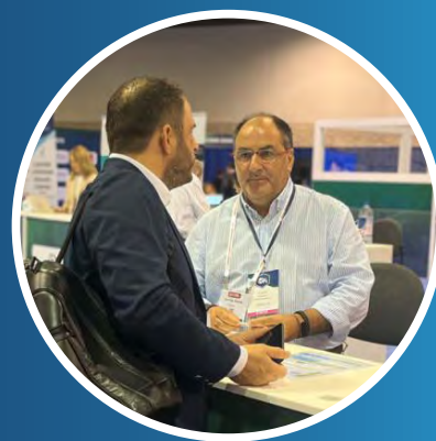
1X1 MEETING BOOTHS