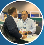
1X1 MEETING BOOTHS