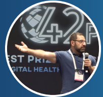
42PLUS1 PITCH AWARD