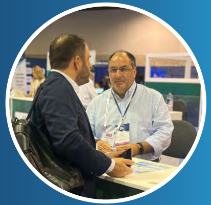
1X1 MEETING BOOTHS