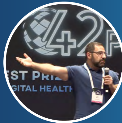
42PLUS1 PITCH AWARD