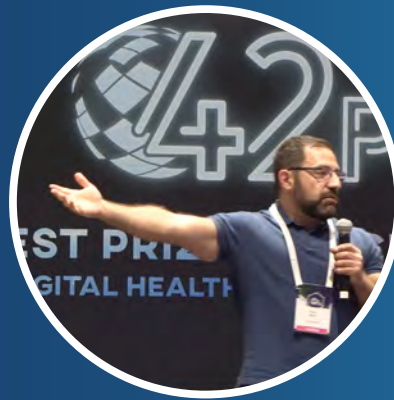
42PLUS1 PITCH AWARD