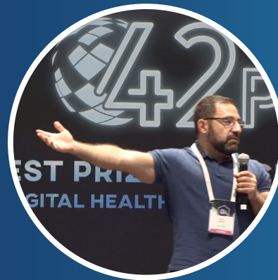
42PLUS1 PITCH AWARD