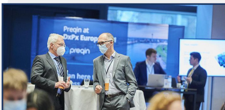
Dedicated Sponsors' Area