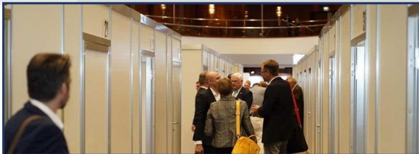
DxPx Partnering Area (one-to-one meetings)

Filled space: 2.000m 2 / 20.000 ft 2 & dedicated venue for panels and sessions.